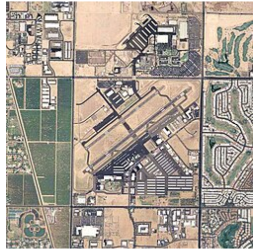
USGS 2006 orthophoto

IATA : MSC · ICAO : KFFZ · FAA LID : FFZ