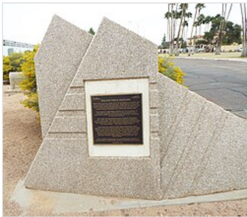
Falcon Field World War II aviation hangars plaque

Aviation AT-6s . The good weather, wide-open desert terrain, and lack of enemy airpower provided safer and more efficient training than was possible in England. Even so, twenty-three British cadets, one American cadet and four instructors were killed and are buried in the Mesa City Cemetery , along with several colleagues who have since died of natural causes. Several thousand pilots were trained there until the RAF installation was closed at the end of the war. The City of Mesa purchased the field from the U.S. government for $1.