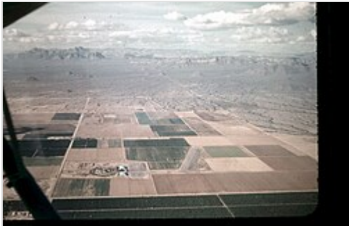
Falcon Field in 1955